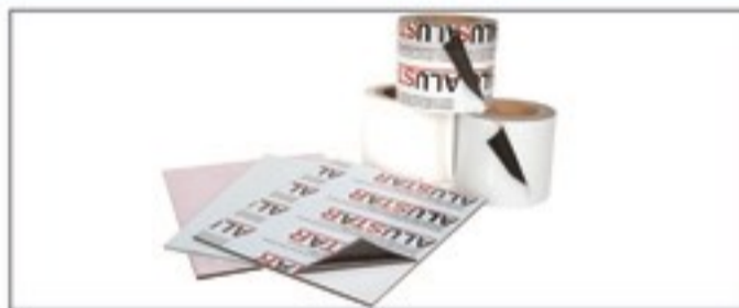
(Brushed, Polished, Mill finish, Power coated, Sand blast...)