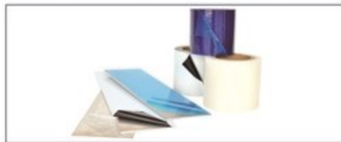
(Brushed, Polished, Mill finish, Power coated, Sand blast...)