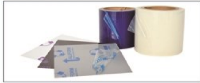
(Pre-painted, Coated, Laminated, Galvanized, Anodized...)